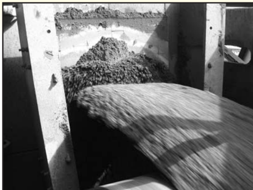
KERAFLEX installed at a ship unloading facility handling taconite