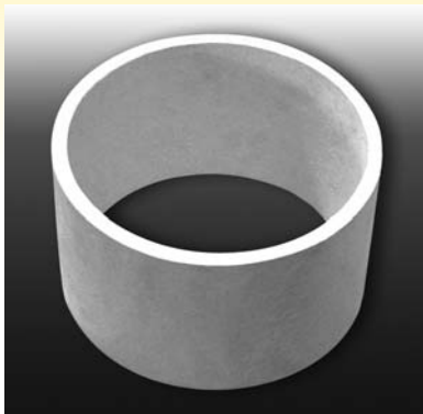
KALCOR-S can be made into cylinders with relatively thin walls. The cylinder shown above has a diameter of 14" (350 mm), a wall thickness of 1/2" (12 mm) and a maximum length of 20" (500 mm).

Can be Easily Adapted to Components that Need Protection from Wear and Heat